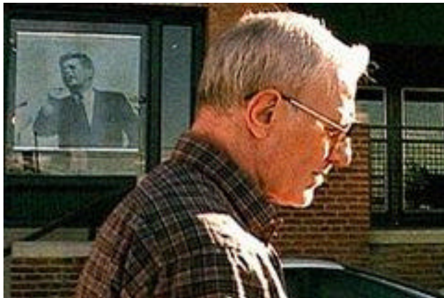
Raymond Barry as Walter Ohlinger, the assassin in Interview With The Assassin .